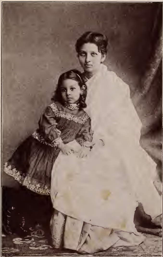
Ramabai on her first visit to America in 1886.